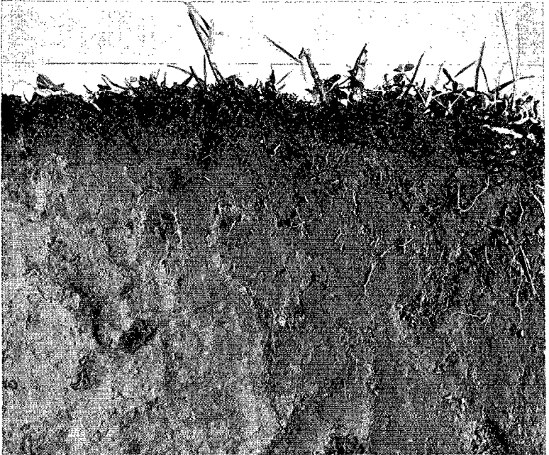
FIG. 3: Soil without beneficial earthworms showing mat of organic material at surface and compact dry nature of the soil beneath.