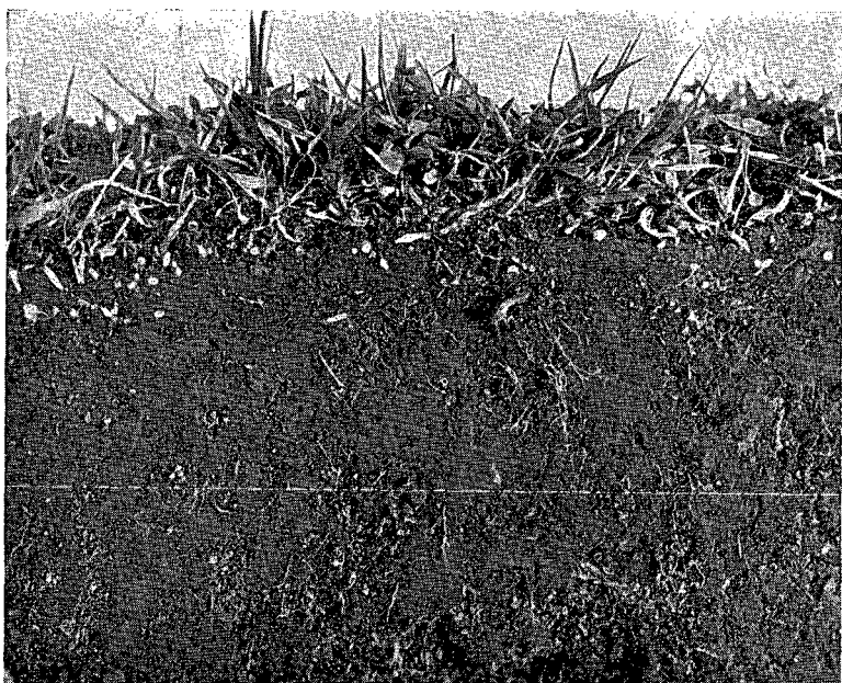
FIG. 4: Soil with earthworms ( A. caliginosa ). Organic material has been incorporated into the soil which is moister and more friable.